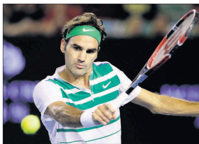
Roger Federer of Switzerland makes backhand return to Grigor Dimitrov of Bulgaria during their third round match at the Australian Open tennis championships in Melbourne, Australia, Friday, Jan. 22, 2016.

Djokovic took care of the man who ended Federer’s run in the third round here