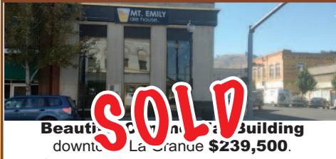
Beautiful Commercial Building downtown La Grande $239,500.