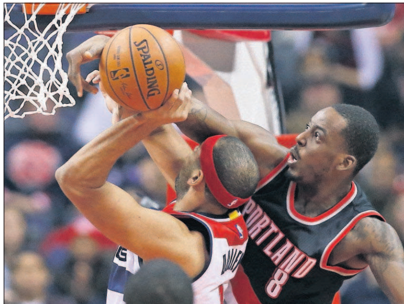
Washington Wizards forward Jared Dudley (1) has his shot blocked by Portland Trail Blazers forward Al-Farouq Aminu (8) in the first half of an NBA basketball game, Monday, Jan. 18, 2016, in Washington.

Against the Wizards, the shots were falling, especially from 3-point range, and there was more attention to detail and less hesitation. The result was a dominant performance from the backcourt of Lillard (16 points) and C.J.