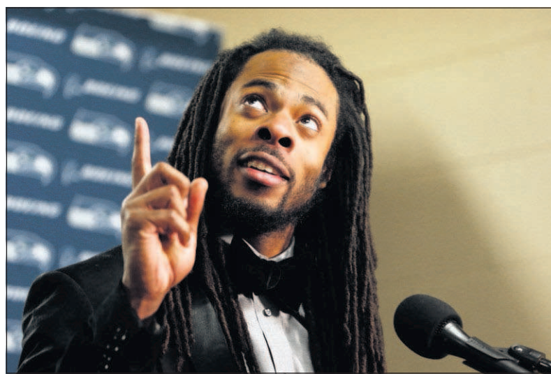
Seattle Seahawks cornerback Richard Sherman (25) points up during a post game news conference after an NFL wild-card football game against the Minnesota Vikings, Sunday, Jan. 10, 2016, in Minneapolis. The Seahawks won 10-9.

"It's more so our standard than anything else. That's what it comes down to. We've played a lot of