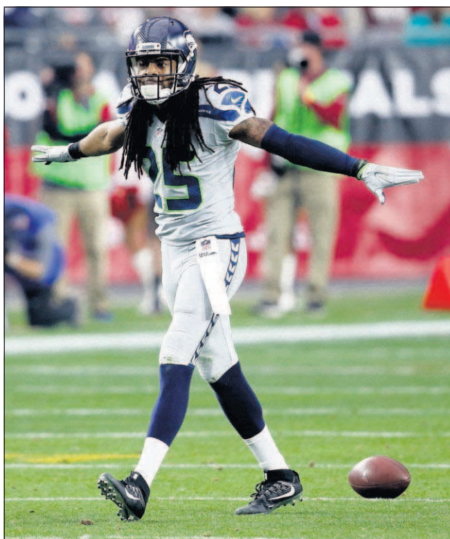
Seattle Seahawks cornerback Richard Sherman (25) celebrates a stop against the Arizona Cardinals during the first half of an NFL football game, Sunday, Jan. 3, 2016, in Glendale, Ariz.

Seattle also led the league in rush defense at 81.5 yards per game, giving up the exact same amount of yards it did a season ago when the Seahawks were third-best in the league at stopping the run. Their first task in the playoffs could be their most