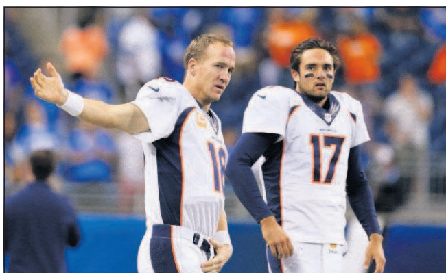
In this Sept. 27, 2015, file photo, Denver Broncos quarterbacks Peyton Manning (18) and Brock Osweiler (17) get ready for the Broncos' NFL football game against the Detroit Lions in Detroit.

—Why they won't: Well, something else matters. The offensive line has been shuffled through injuries, leaving Brady vulnerable.