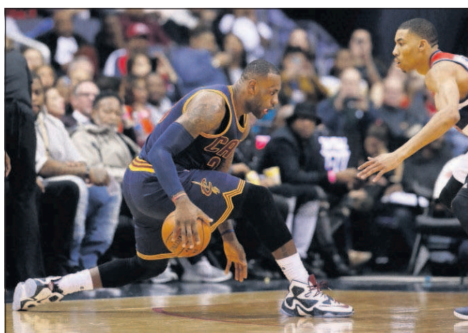
Cleveland Cavaliers forward LeBron James (23) works the ball as Washington Wizards forward Otto Porter Jr. defends during the second half of an NBA basketball game Wednesday, Jan. 6, 2016, in Washington. The Cavaliers won 121-115.