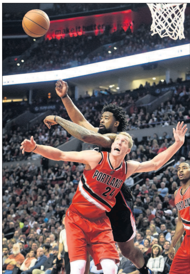
Los Angeles Clippers center DeAndre Jordan (6) and Portland Trail Blazers center Mason Plumlee (24) compete for a loose ball during the second half of an NBA basketball game in Portland, Ore., Wednesday, Jan. 6, 2016. The Clippers won 109-98.

"When you have a guy on your team that can recognize plays that you should run without having to look back (at the coach) — he called four in a row, that were perfect calls," Rivers said about his star point guard.