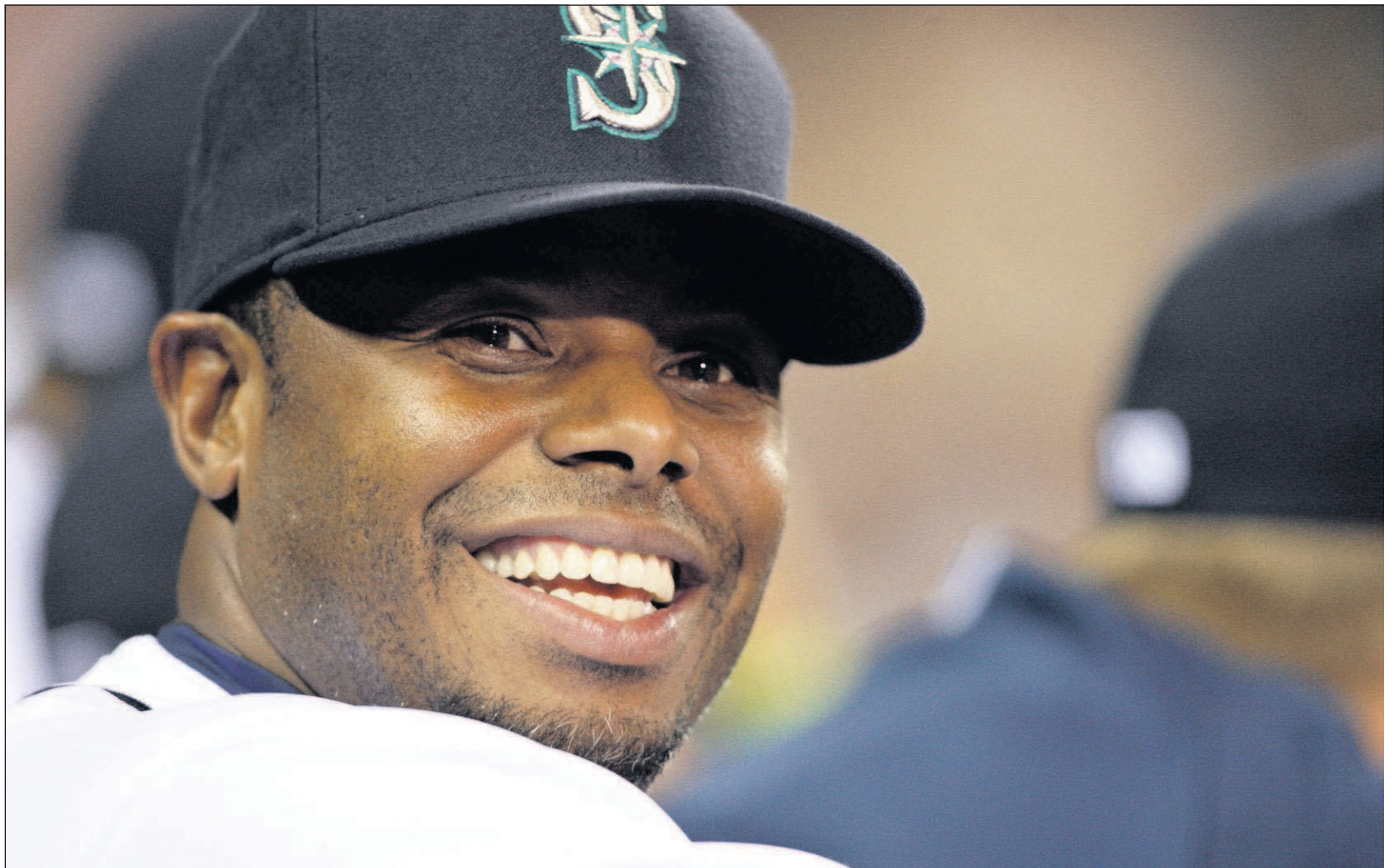
In this Sept. 15, 2009, file photo, Seattle Mariners' Ken Griffey Jr. smiles in the dugout during a baseball game against the Chicago White Sox in Seattle.