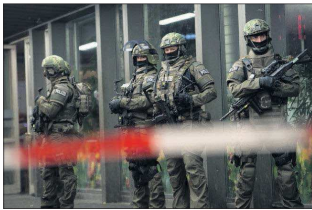
Sven Hoppe/dpa via AP

In this photo provided by Trevor Hale, smoke and flames pour out from a residential building as a fire runs up some 20 stories of the high rise in Dubai, United Arab Emirates, Thursday. Fire engulfed the luxury building near the world’s tallest skyscraper as tens of thousands of people were gathering at its base for one of the world’s largest New Year’s fireworks displays.