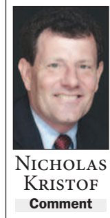
NICHOLAS KRISTOF Comment

Nicholas Kristof grew up on a sheep and cherry farm in Yamhill, Oregon. A columnist for The New York Times since 2001, he won the Pulitzer Prize two times, in 1990 and 2006.