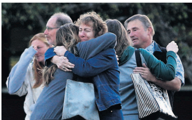
In this Oct. 5 file photo, faculty members embrace on their return to Umpqua Community College, in Roseburg following the fatal shooting of nine people there.