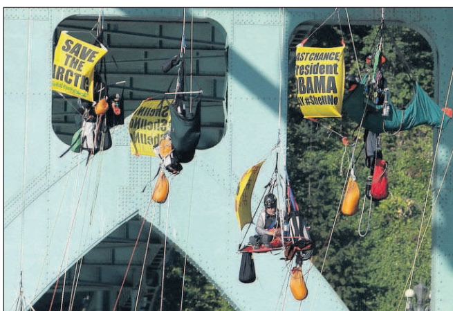
In this July 29 file photo, activists hang from the St. Johns Bridge in Portland to protest the departure of Royal Dutch Shell PLC icebreaker Fennica, which is in Portland for repairs.

Obama lamented that mass shootings and the reaction to them have become "routine." He visited the timber town to meet privately with grieving families, ignoring protests from gun-rights activists.