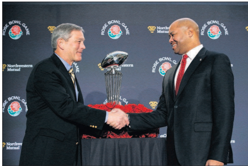
Stanford head coach David Shaw, right, and Iowa head coach Kirk Ferentz shake hands during a news conference for the Rose Bowl NCAA college football game, Wednesday, Dec. 30, 2015, in Los Angeles. Stanford and Iowa are scheduled to play on New Year's Day.

Stanford's improbable Nerd Nation powerhouse is back yet