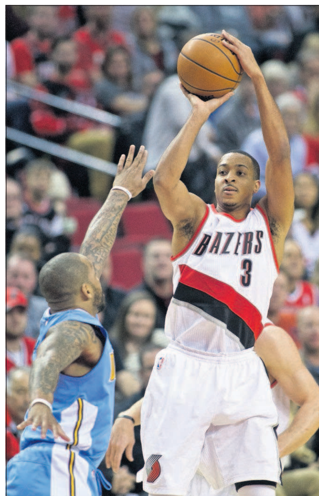
Portland Trail Blazers guard C.J. McCollum, right, shoots over Denver Nuggets guard Jameer Nelson, left, during the second half of an NBA basketball game in Portland, Ore., Wednesday, Dec. 30, 2015.