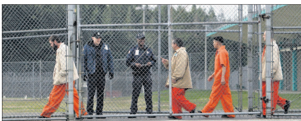
In this 2011 file photo, inmates walk past correctional officers at the Washington Corrections Center in Shelton, Wash. Gov. Jay Inslee said Tuesday that more than 3,000 prisoners in Washington have been mistakenly released early since 2002 because of an error by the state's Department of Corrections.