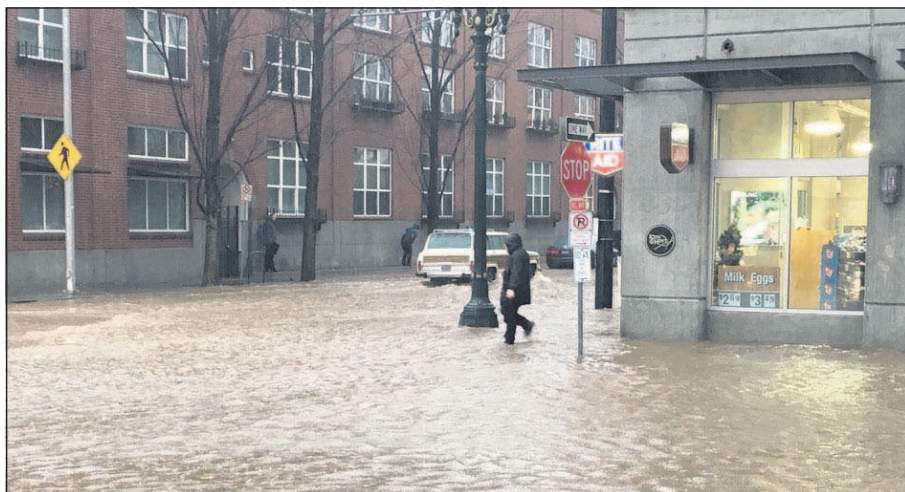
A pedestrian walks through flooding on NW 10th and Hoyt St. as heavy rains drench Portland, Monday. The National Weather Service on Monday issued a flood watch for much of northwest Oregon and southwest Washington.