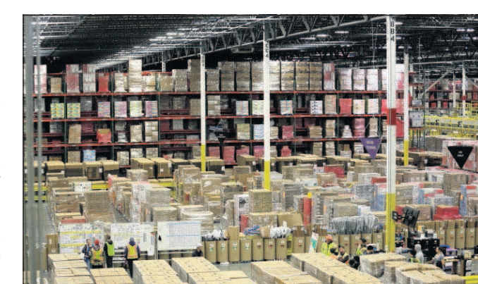
Workers gather Monday in a section packed high with merchandise at Amazon.com's fulfillment center in DuPont, Wash.

By MAE ANDERSON AP Technology Writer NEW YORK — Shoppers traded bricks for clicks on Monday, flocking online to snap up "Cyber Monday" deals on everything from cashmere sweaters to Star Wars toys. Now that shoppers are online all the time anyway, the 10-year-old shopping holiday has lost some of its luster as online sales on Thanksgiving and Black Friday pick up. But enough shoppers have been trained to look for "Cyber Monday" specific sales to ensure the holiday will still mean big bucks for retailers. It's too early for sales figures, but Monday is still expected to be the biggest online shopping day ever, likely racking up more than $3 billion in sales, according to research firm comScore. As of 7 p.m. Monday, Adobe estimated Cyber Monday sales would rise 12 percent to $2.98 billion by the end of the day. A more complete picture of Cyber Monday sales will be available when comScore releases figures on Wednesday. "A lot of people wait to see if deals are better on Cyber Monday," said Forrester Research analyst Sucharita Mulpuru.