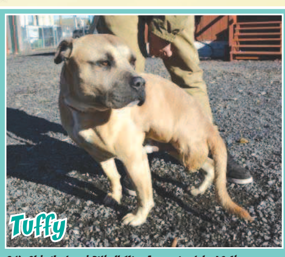
2 Yr Old, Neutered Pitbull Mix, Approximately 60 Lbs.

For more information. visit www.wildhorseresort. com or contact Tiah DeGrofft at 541-966-1628 or tiah.degrofft@wildhorsere-