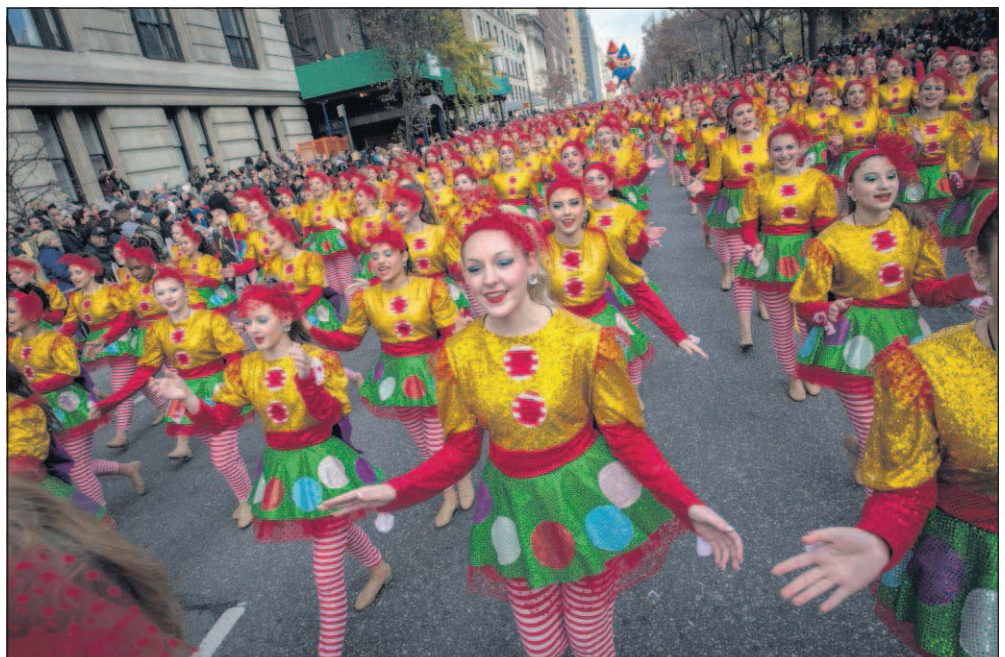
Dancers move down Central Park West during the Macy's Thanksgiving Day Parade Thursday in New York.