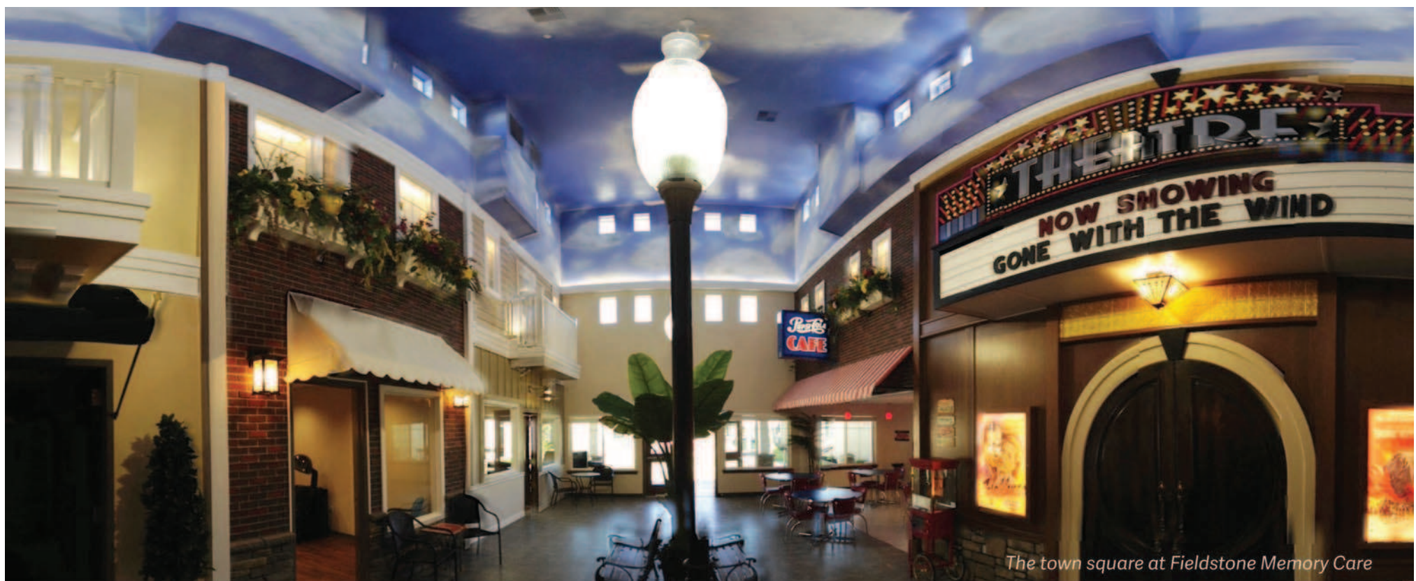
The town square at Fieldstone Memory Care

The East Oregonian works hard to be accurate and sincerely regrets any errors. If you notice a mistake in the paper, please call 541-966-0818.