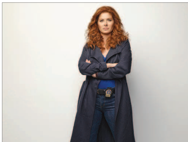
Debra Messing stars in "The Mysteries of Laura"