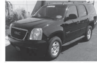
2011 GMC Yukon

$0 Down Plus Tax, Lic, And Doc Fee 84 Mos @ $197.49 Per Mo. 2.99% O.A.C.