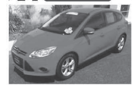
2012 Ford Focus

It's Our Mission To Exceed Your Expectations!