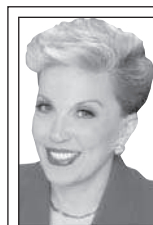
JEANNE PHILLIPS Advice