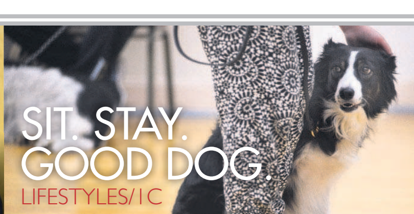
SIT. STAY. GOOD DOG. LIFESTYLES/1C