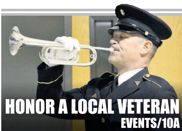
HONOR A LOCAL VETERAN EVENTS/10A