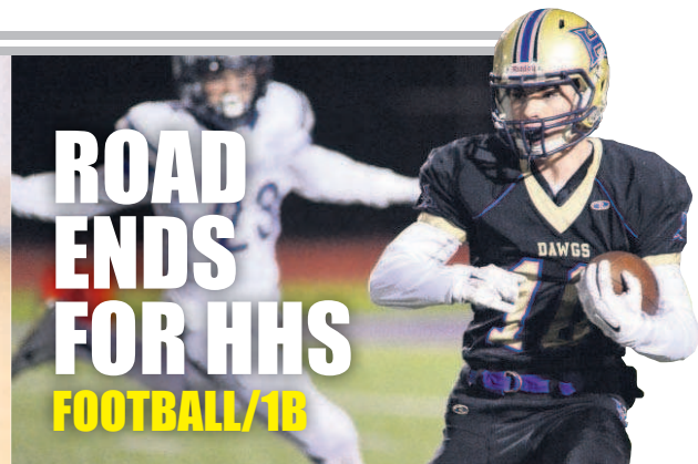
ROAD ENDS FOR HHS FOOTBALL/1B