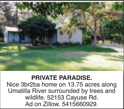
PRIVATE PARADISE. Nice 3br2ba home on 13.75 acres along Umatilla River surrounded by trees and wildlife. 52153 Cayuse Rd. Ad on Zillow. 5415660929.