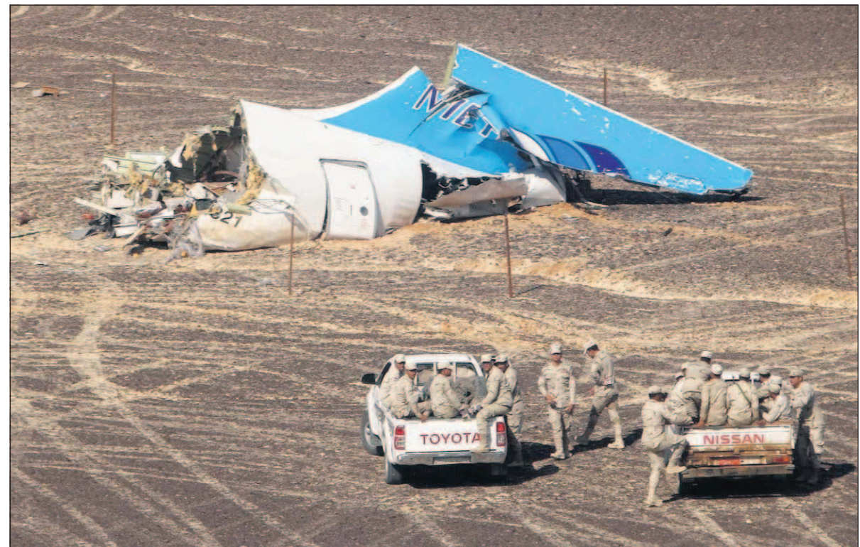
Egyptian military vehicles approach the wreckage of a passenger jet bound for St. Petersburg in Russia that crashed in Hassana, Egypt. The Russian cargo plane on Monday brought the first bodies of Russian victims to St. Petersburg, a city awash in grief for its missing residents.