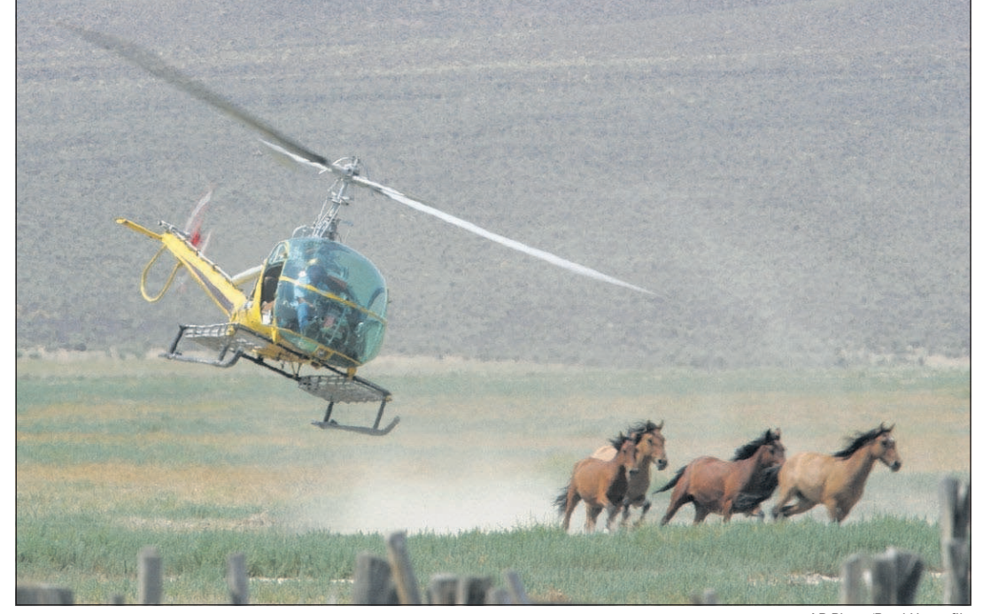
In this July 2008 photo, a helicopter pilot rounds up wild horses from the Fox & Lake Herd Management Area in Washoe County, Nev. Wild horse advocates are calling for a stop to a large roundup of wild horses starting this week in southern Oregon.

Horses that are rounded up will be available for adoption, though most will likely end up in government holding facilities.