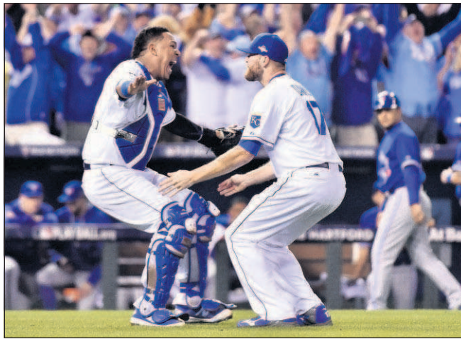
Kansas City Royals catcher Salvador Perez, left, and relief pitcher Wade Davis celebrate after defeating the Toronto Blue Jays in Game 6 of baseball's American League Championship Series on Friday, Oct. 23, 2015, in Kansas City, Mo. The Royals won 4-3.

Bautista became the first Blue Jay in postseason history to hit two homers in a game when he followed his solo shot in the fourth inning with a tying, two-run homer in the eighth on Friday night. But it was his throw from right field in the bottom half of the inning, just after a 45-minute rain delay, that allowed the Royals to score the go-ahead run. Lorenzo Cain had reached base with a hard-earned walk off Roberto Osuna, and Eric Hosmer rapped a single down the line. Bautista fielded it cleanly and fired to second base, thinking that Hosmer might try to stretch the hit into a double. The longer throw gave Cain the time he needed to score from first base. "I had a feeling Bautista