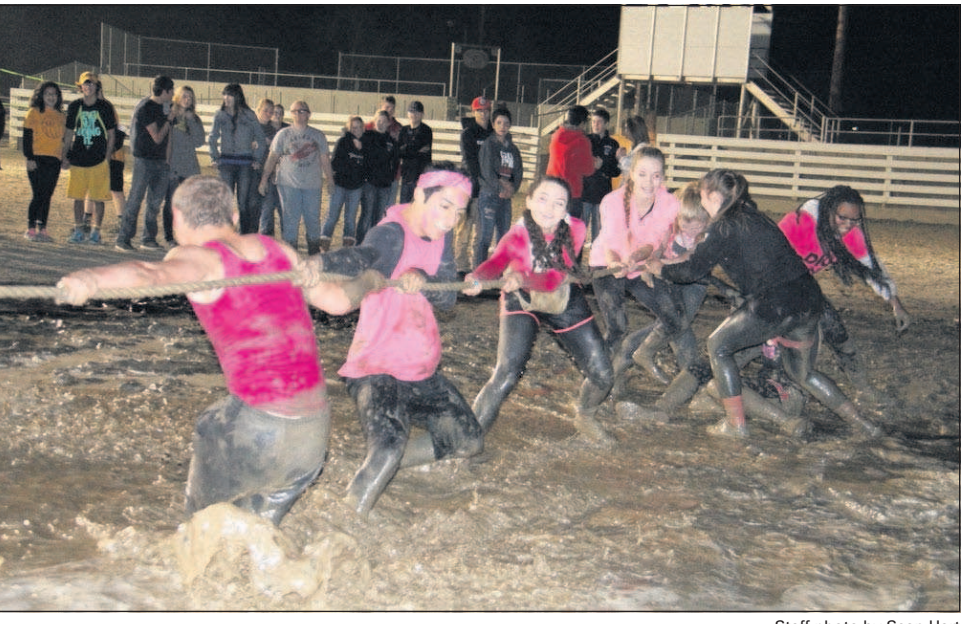
Hermiston High School students compete in a tug-of-war Thursday at the Farm-City Pro Rodeo grounds.

"I think it's really cool looking at everybody being so creative with everything: the dress-ups and the time that people put into their outfits and the games they