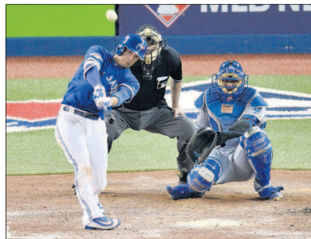
Toronto Blue Jays' Ryan Goins hits a home run off Kansas City Royals' pitcher Kris Medlen during the fifth inning in Game 3 of the ALCS on Monday.

Despite being outthit 15-11 by the pesky Royals, Toronto pounced on Kansas City pitching in the first ALCS game at Toronto since 1993. The Blue Jays scored their most runs ever at home in the postseason