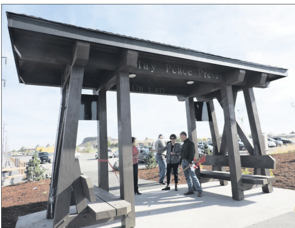
A new arch towers over the entrance of Oxbow Trail. A drinking fountain will be added in the spring.

The arch, which reads "May Peace Prevail on Earth," is on Good Shepherd Medical Center land and the city has agreed to maintain the arch and surrounding landscaping.