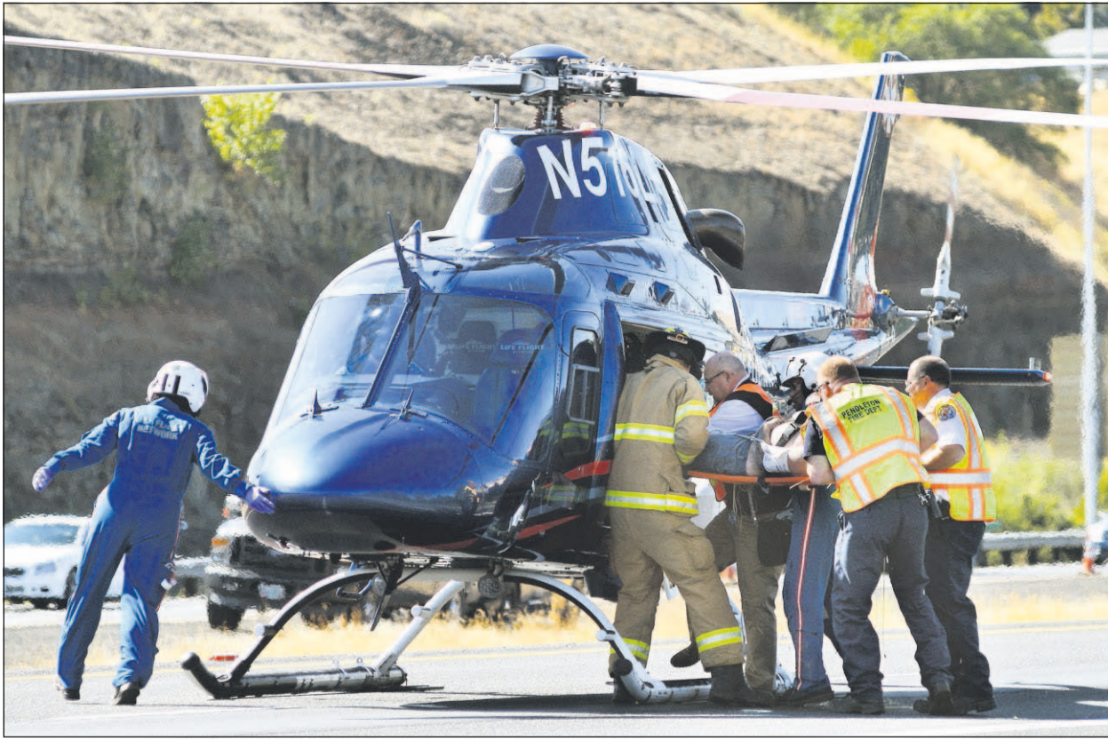
Pendleton fire personnel load a victim of a single vehicle rollover into a Life Flight helicopter Thursday in the middle of the eastbound lanes of Interstate 84 near mile marker 209 in Pendleton.

Emergency radio communications reported a vehicle was on fire and there may have been a victim inside. They also stated a small child suffered injuries in the crash, and a Life Flight helicopter transported the child.