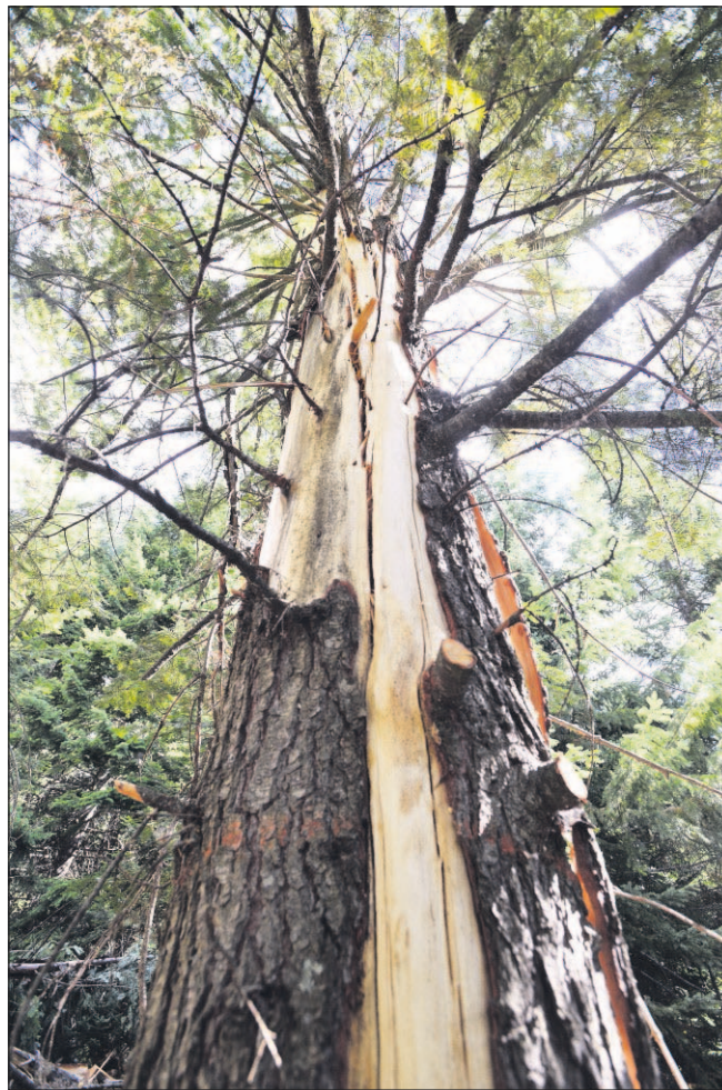
A white spruce tree stands split by a June lightning storm on the heavily forested property of Jerry Wyland outside of Weston.

For years, Wyland has secured grants through