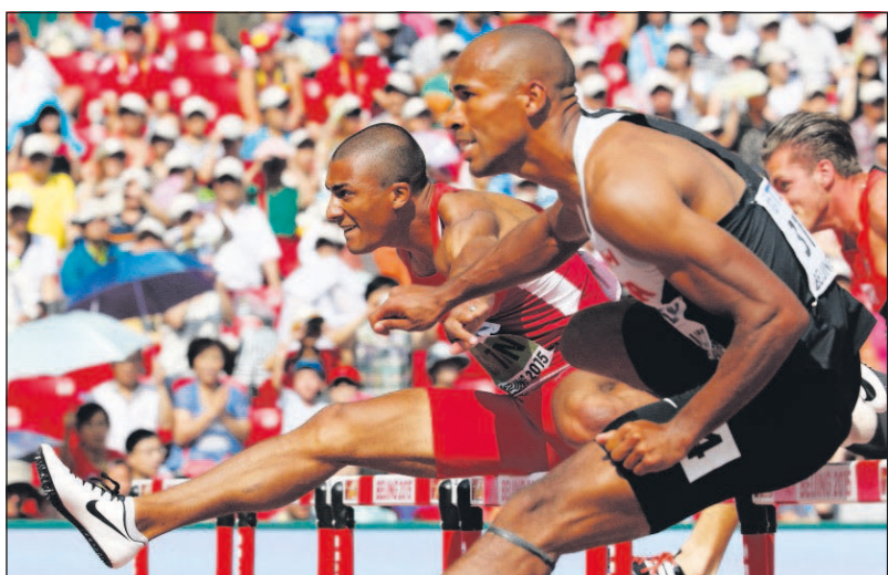
United States' Ashton Eaton, left, leads Canada's Damian Warner in a men's 110m hurdles decathlon heat at the World Athletic Championships at the Bird's Nest stadium in Beijing, Saturday, Aug. 29, 2015.