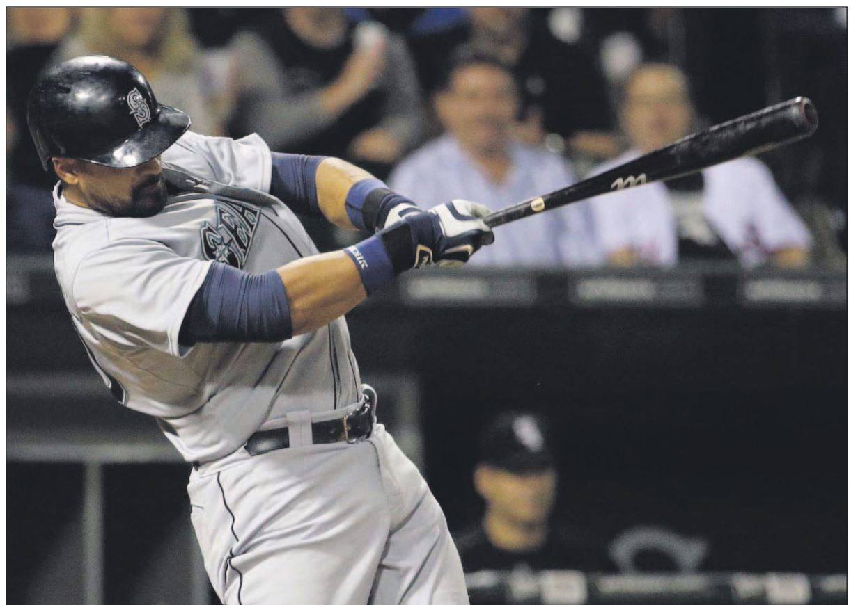
Seattle Mariners' Franklin Gutierrez hits a solo home run during the sixth inning of a baseball game against the Chicago White Sox Friday in Chicago.