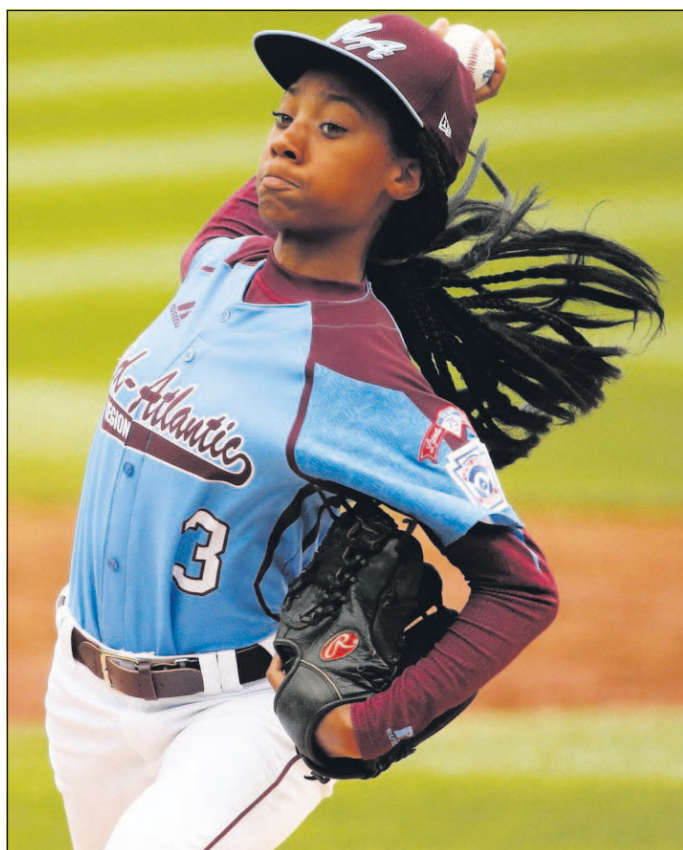
In this Aug. 15, 2014, file photo, Pennsylvania's Mo'ne Davis delivers in the first inning against Tennessee during a baseball game at the Little League World Series tournament in South Williamsport, Pa.