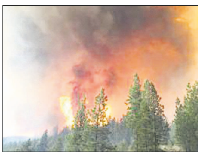
The Cornet Fire burns about 16 miles of Baker City, and is one of several large wildfires spreading across Baker

• Eldorado Fire Reported Friday morning, burning on 2,500 acres of combined BLM, ODF and Wallowa-Whitman National Forest lands about eight miles southeast of Unity near Eldorado Campground in Baker County. The fire closed