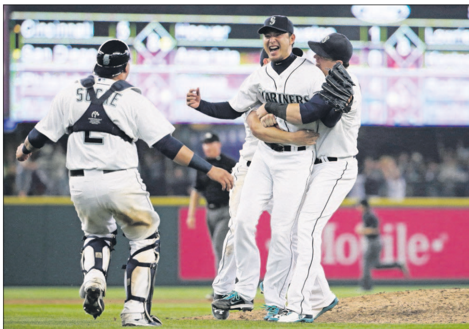
Seattle Mariners starting pitcher Hisashi Iwakuma, second from right, is greeted by teammates after Iwakuma threw a no-hitter against the Baltimore Orioles Wednesday in Seattle. It was Seattle's fourth no-hitter in franchise history and first one since Felix Hernandez in 2012.