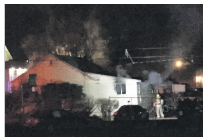
Firefighters work to put out an early Tuesday morning house fire on SE 7th Street in Hermiston.