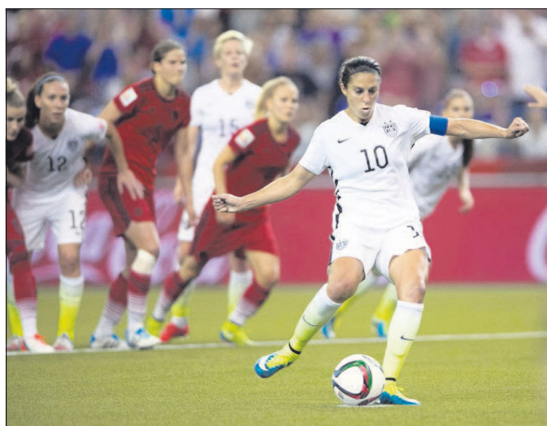
United States' Carli Lloyd (10) scores on a penalty kick against Germany during the second half of a semifinal in the Women's World Cup soccer tournament, Tuesday, June 30, 2015, in Montreal, Canada. The United States won 2-0.