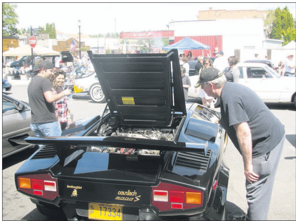
A 1985 Lamborghini Countach drew spectators at a past Automobile Club of Echo car show in downtown Echo. This year's car show is Saturday from noon to 6 p.m. in downtown Echo.

MONDAY, MAY 25 MEMORIAL DAY SERVICE , 10 a.m., Hermiston Cemetery, South Highway 395 and Cemetery Road, Hermiston. The Army National Guard will present a flag