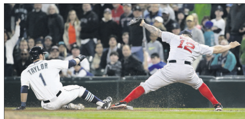
Seattle Mariners' Chris Taylor is out on a double play at first base after Boston Red Sox first baseman Mike Napoli (12) made the catch and Taylor couldn't get back to the base in time after Justin Ruggiano flew out to right field in the seventh inning of a baseball game, Thursday in Seattle.

Holt lined the second pitch of the ninth from Seattle closer Fernando Rodney (1-2) into left-center and was easily safe at second when Weeks' throw sailed