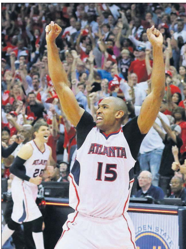
Atlanta Hawks center Al Horford reacts after hitting the game winning shot to beat the Washington Wizards 82-81 in their Eastern Conference Semifinals game 5 on Wednesday, May 13, 2015, in Atlanta. At left is teammate Kyle Korver.

Atlanta is one victory from advancing to the third round of the playoffs for the first time since moving from St. Louis in 1968. Game 6 is Friday night in Washington.