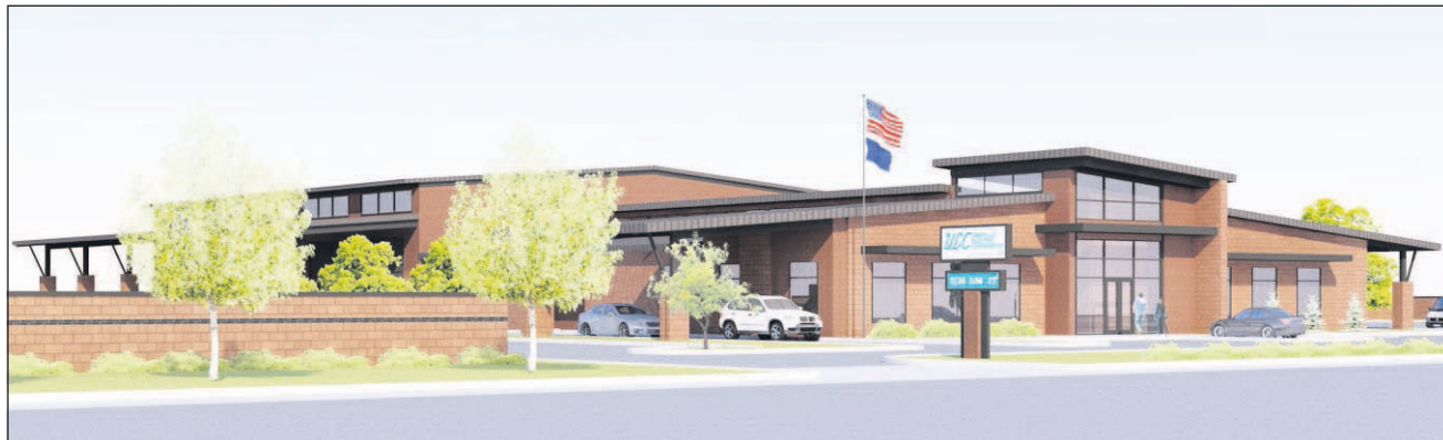
The new Boardman Operations Center is expected to be completed by mid-2016.