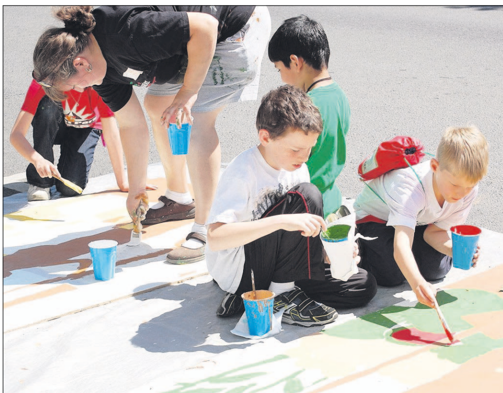
Children participate in a mural project during the 2014 Eastern Oregon Arts Festival in downtown Hermiston. This year's event kicks off Friday with an artists' reception.

Another new festival feature includes the OSU