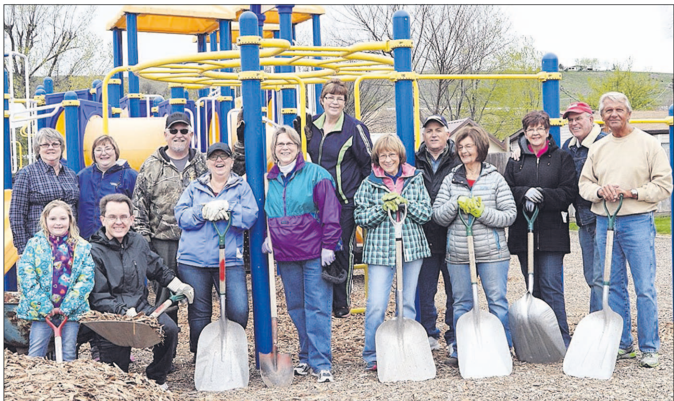
The Kiwanis Club of Pendleton participated in project at Kiwanis Park as part of Kiwanis One Day, a day of service by Kiwanis clubs across the globe.