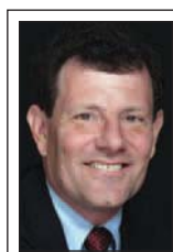
NICHOLAS KRISTOF Comment

Public debates often dance around basic statistical concepts, like standard deviation,