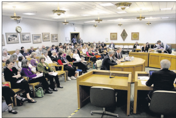
A full house is seated for a public hearing of the House Committee on Rules on Senate Bill 941 at the Oregon State Capitol in Salem, Wednesday. The bill would require background checks for private gun sales and transfers. There were also three overflow rooms.

The Daily Astorian reports the 210-foot Steadfast patrols from the Pacific Northwest to South America.