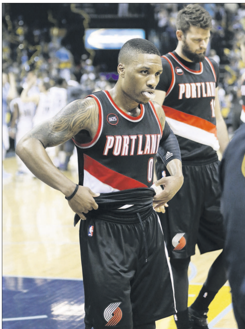
Portland Trail Blazers guard Damian Lillard (0) and center Joel Freeland, of England, right, leave the court after losing to the Memphis Grizzlies in Game 2 of an NBA basketball Western Conference playoff series Wednesday, April 22, 2015, in Memphis, Tenn. The Grizzlies won 97-82 and lead the series 2-0.