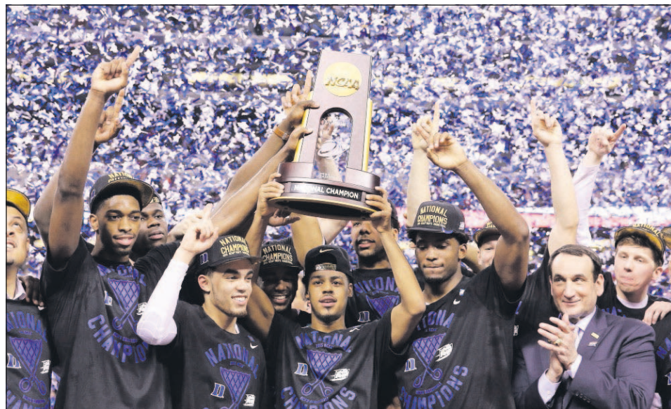
Duke players celebrate with the trophy after their 68-63 victory over Wisconsin in the NCAA Final Four championship game Monday in Indianapolis.