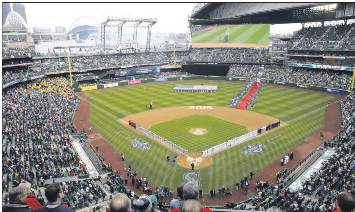
A large U.S. flag is displayed at Safeco Field as the Seattle Mariners and the Los Angeles Angels stand on the baselines before their opening day game Monday in Seattle.