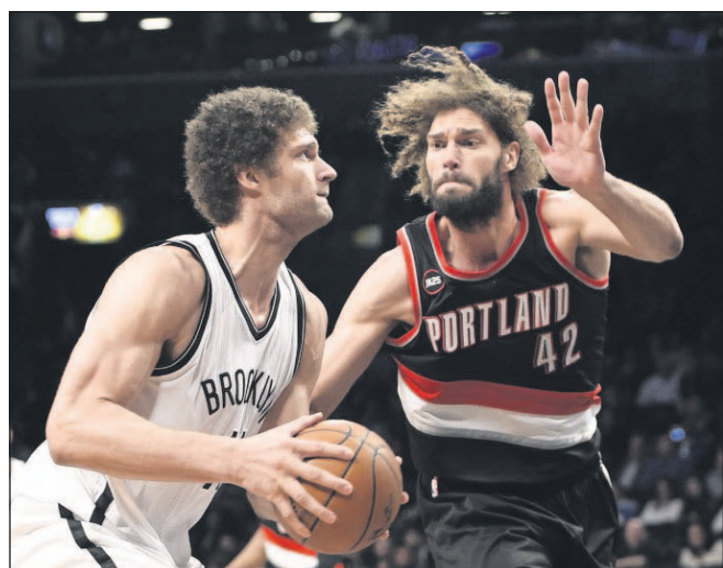
Brooklyn Nets center Brook Lopez moves around his twin brother, Trail Blazer Robin Lopez on Monday.