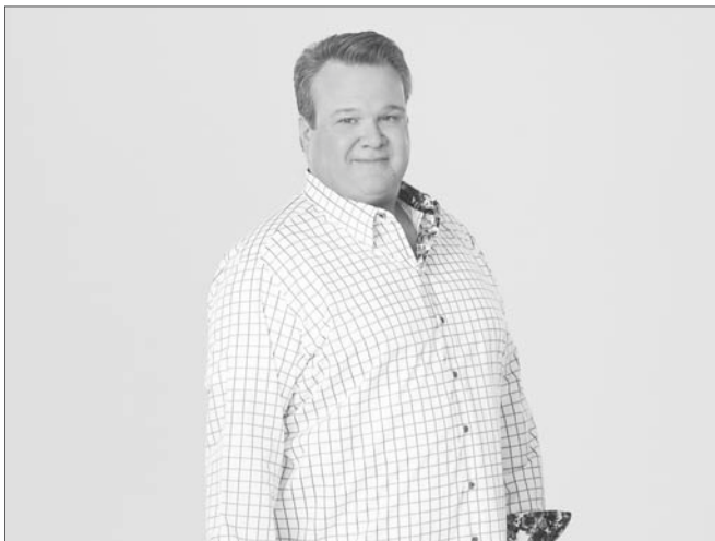
Eric Stonestreet stars in "Modern Family"