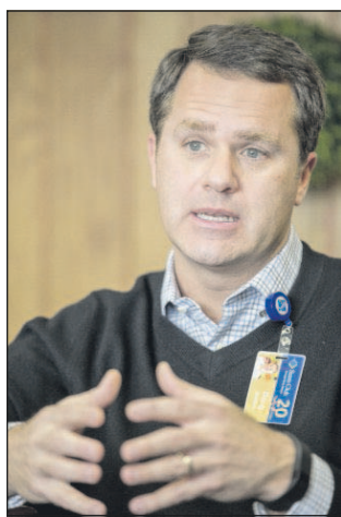
Doug McMillon, Wal-Mart President and CEO