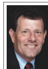
NICHOLAS KRISTOF Comment

I’ve also changed my mind because, in recent years, the worst abuses by far haven’t been in the union shop but in the corporate suite. One of the things you learn as a journalist is that when there’s no accountability, we humans are capable of tremendous avarice and venality. That’s true of union bosses — and of corporate tycoons. Unions, even flawed ones, can provide checks and balances for flawed corporations.